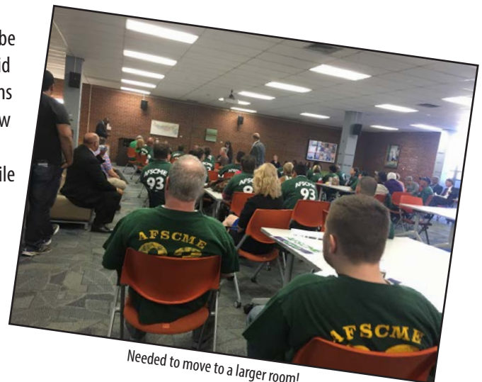
Needed to move to a larger room!