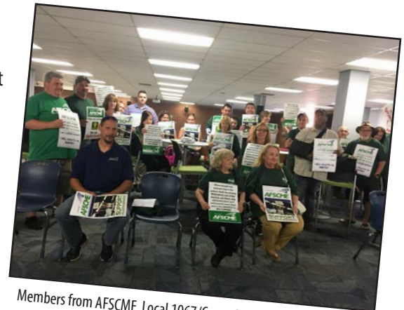
Members from AFSCME Local 1067/Council 93 showing solidarity!