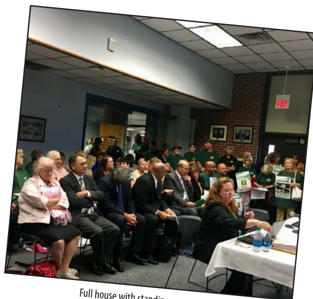
Full house with standing room only!